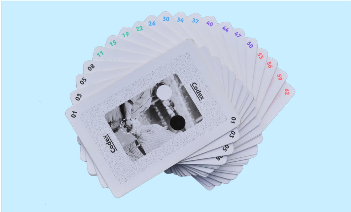
Fig. 1. DSKD Method Cards, Friis & Gelting, 2011